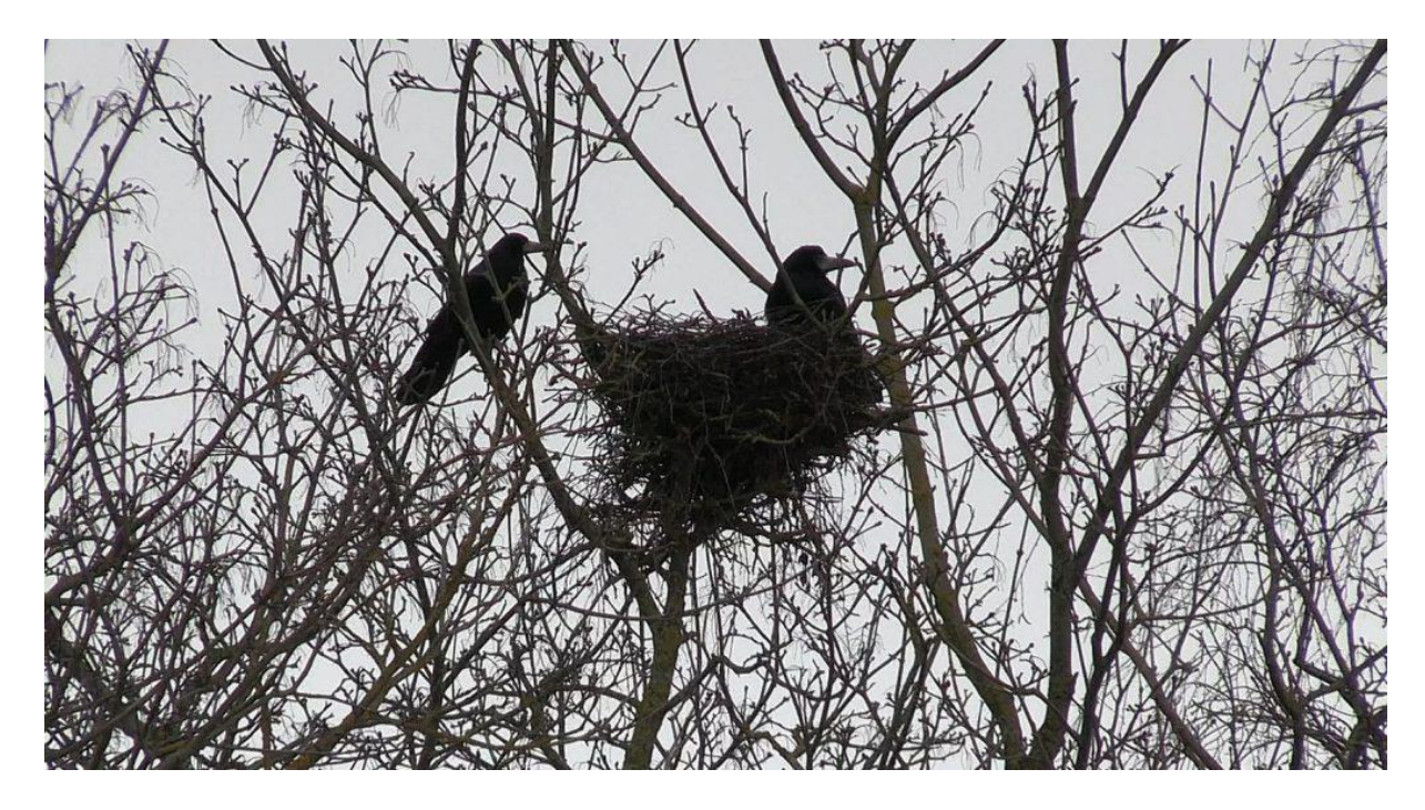
Figure 2 - Video rush T_SP_220329_R07 of a pair of Corvus frugilegus building their nest.