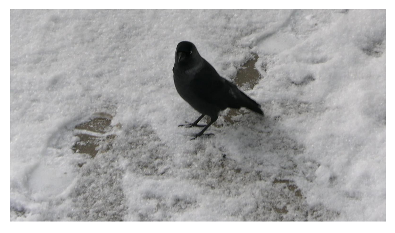
Figure 3 - Video rush T_W_211208_R13 (0'38) of a frightened but bold Coloeus monedula trying to pick up back the food lost when it hit my leg