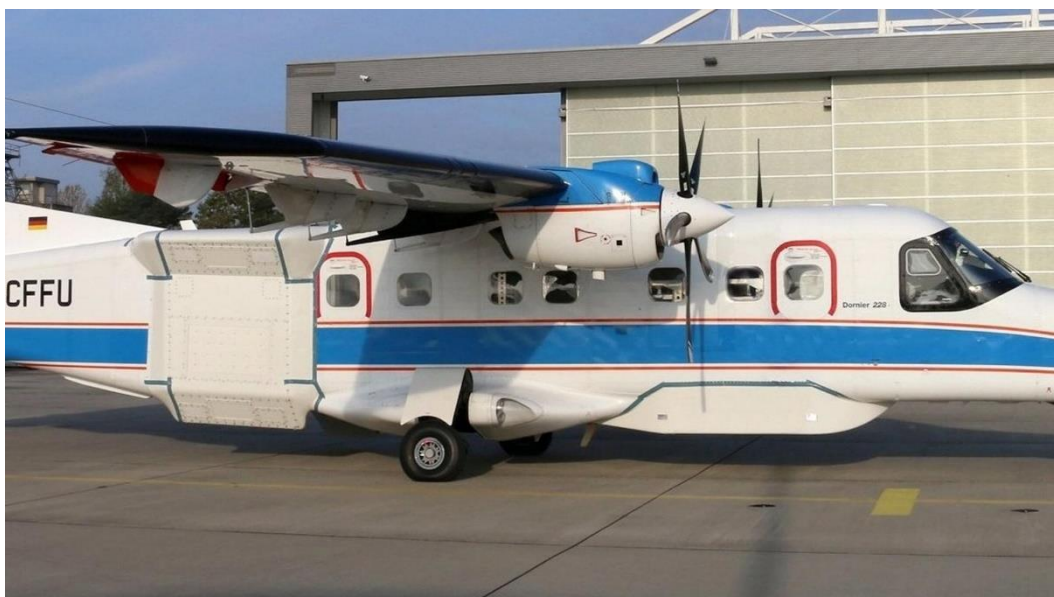
Figure 4 : F-SAR installed on board the DLR Do 228-212 research aircraft.