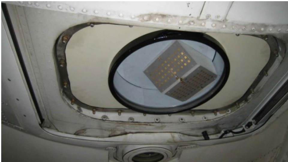
Figure 2 : KuROS antennae on-board the SAFIRE ATR42.