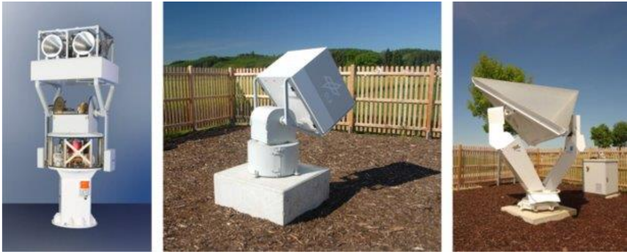
Figure 5 : Calibration devices of DLR's SAR Calibration Center.